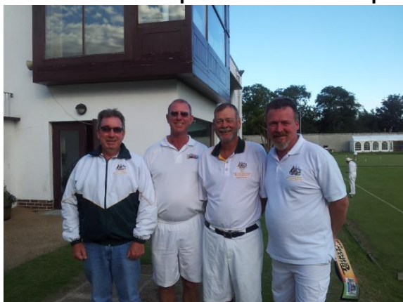
Aussie contingent at Carrackmines, Dublin