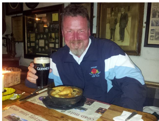
Guinness and Irish Stew