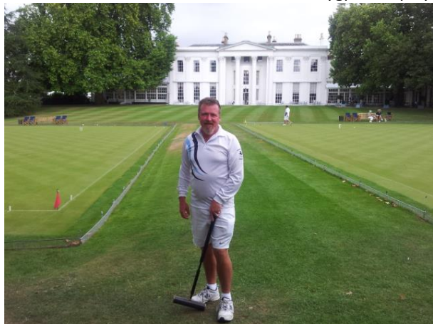
In front of Hurlingham clubhouse in Wagga shirt Usually only pure white is allowed