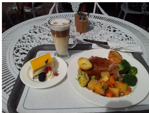
Lunch at Hurlingham