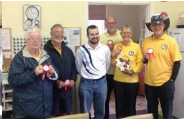
Blue Mountains – Team Runners Up

Gateballers enjoyed better playing conditions on the Sunday for the triples competition. Teams were randomly drawn which made for interesting combinations of players.